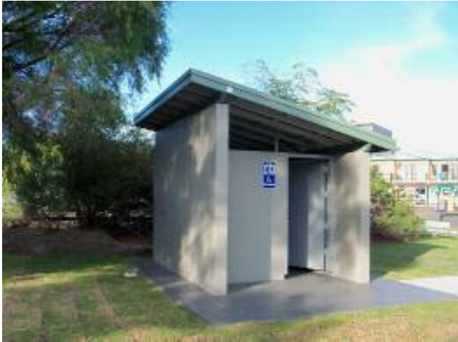
New amenities block at Parkes Crescent Park